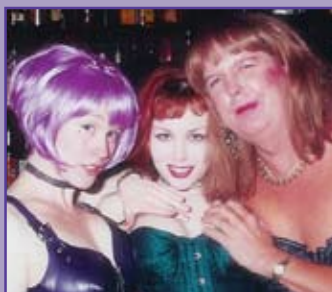
CAFE KINK (www.cafekink.com)

PASSIONAL Magazine has gone interactive/online! - PASSIONAL Boutique is ready to expand online and in real life! More events, parties and infamy for all our PASSIONAL people!