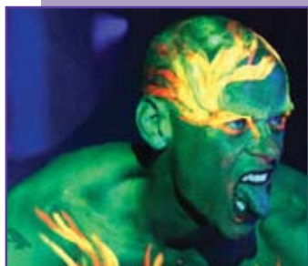
LIBERTINE BALL (www.libertineball.com)

Check out the brand spankin' NEW PassionalMagazine.com for WEEKLY feature updates and events listings (national and local to Philadelphia)