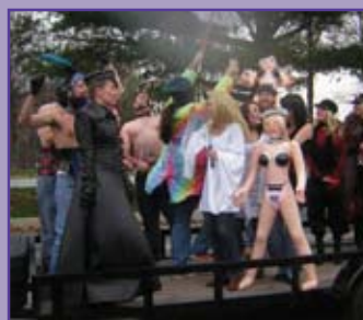
WMMR SPANKSGIVING DAY (www.prestonandsteve.com)