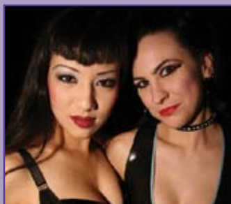
DIABOLIQUE BALL (www.diaboliqueball.org)