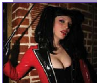
NATIONAL TOURING (www.fetishcon.com)